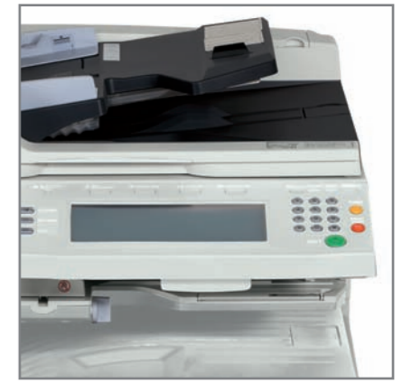
ADJUSTABLE TOUCH-SCREEN PANEL with intuitive menu