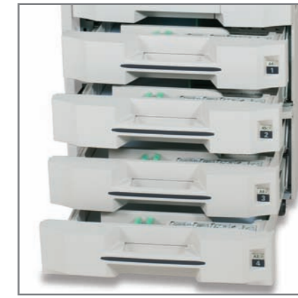
4 UNIVERSAL CASSETTES for a maximum paper capacity of 2,200 sheets