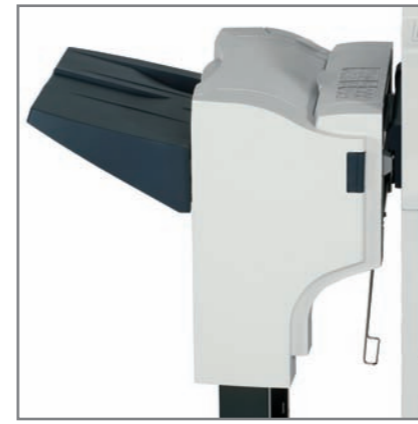
DF-730 FINISHER with a 1,000-sheet output capacity tray