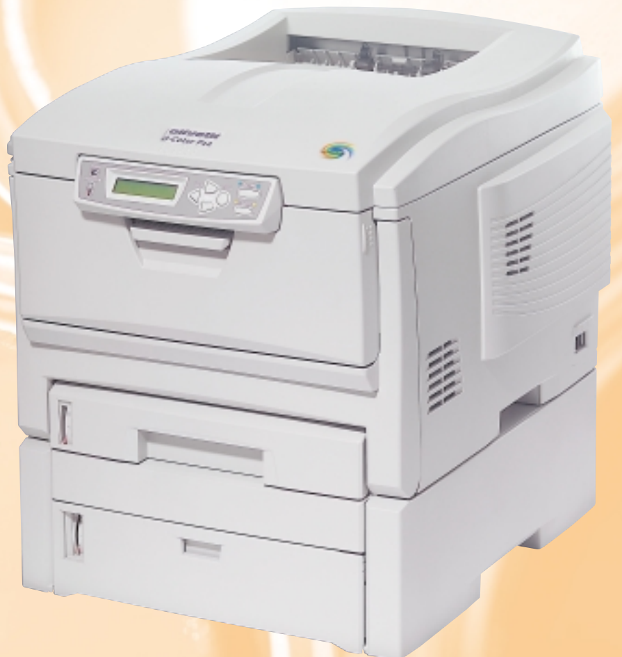
Olivetti d-Color P12 The single-pass digital colour printer for A4 paper